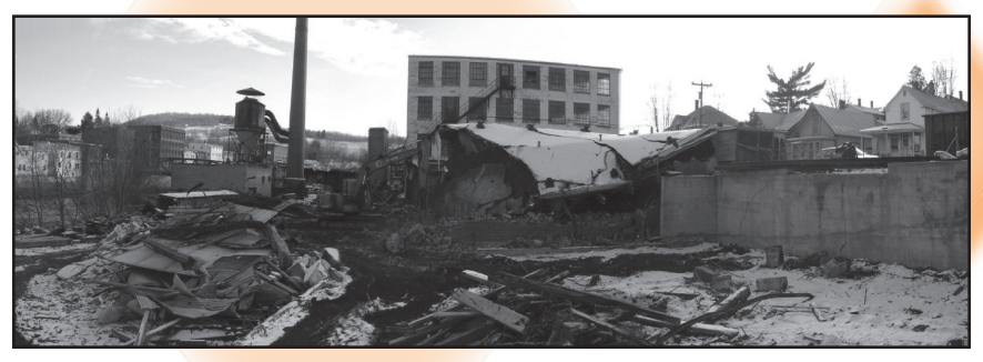
Former furniture manufacturer, Richford, Vermont

Most people associate brownfields with large industrial complexes located in densely developed cities and towns. Such sites can certainly be found in Vermont. Examples include manufacturing facilities, rail yards, coal gasification plants and assorted other "heavy" industry sites located in our cities and downtowns.